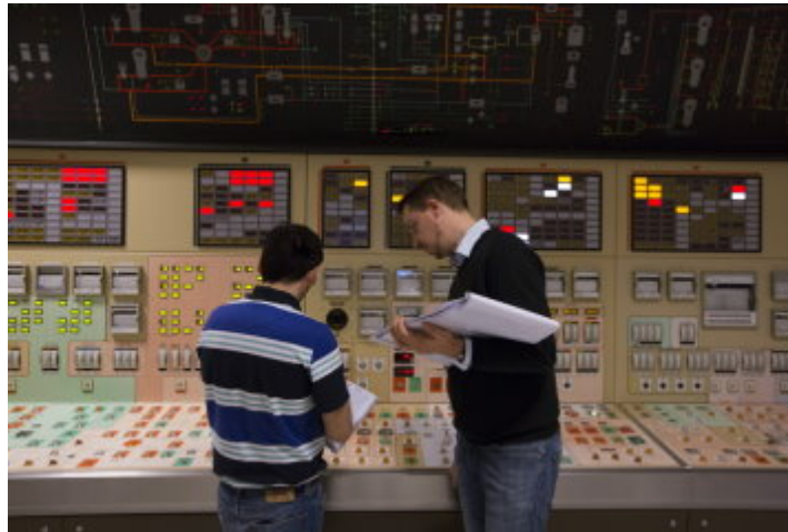
Figure 7: Daily safety dialogue in the control room