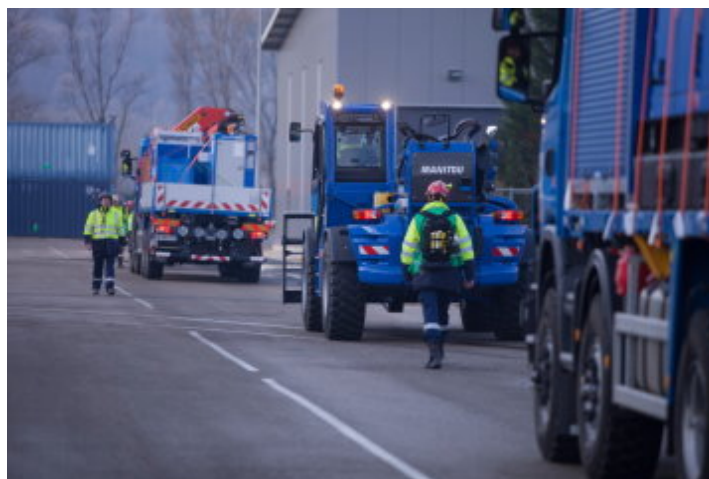
Figure 8: Crisis preparedness drill

Each year, approximately 100 emergency exercises are conducted over the entire French nuclear fleet, i.e. approximately one every three days. Approximately 10 drills take place at national level, under the oversight of the ASN and involve EDF and the public authorities, in particular the prefectures. As one of the lessons learned after the first drills, stable iodine tablets have been pre-distributed in a perimeter of approximately 10 kilometres in order to better protect children against exposure to radioactive iodine in case of accident. As a lesson learned from the Fukushima accident, national assistance systems were reinforced with additional technical and human resources planned in situ to respond to a crisis.