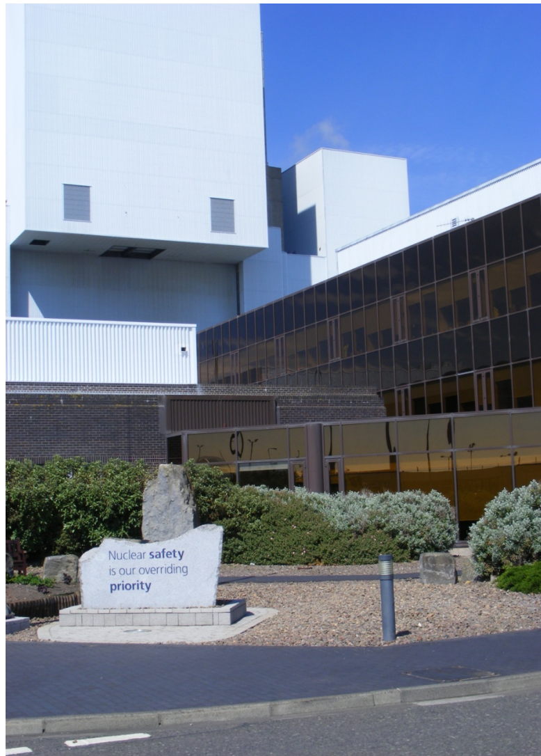
Figure 9: Nuclear Safety, our overriding priority