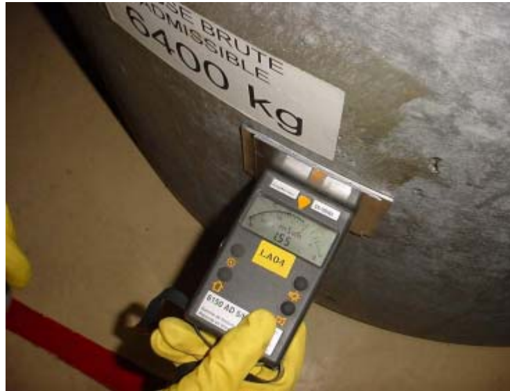
Figure 10: Waste characterisation

In France , in cooperation with the Agence nationale pour la gestion des déchets radioactifs (ANDRA, National Agency for Radioactive Waste Management), EDF ensures that final storage of radioactive waste takes place safely, under the best technical, economic and environmental conditions.