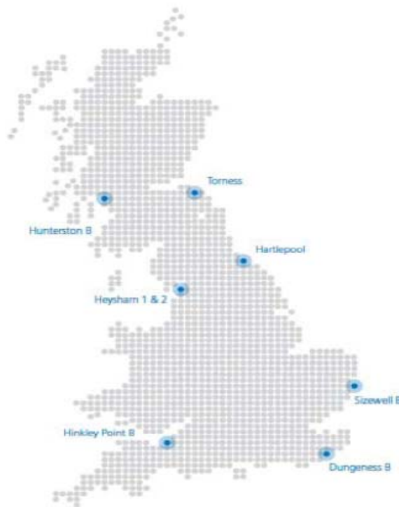
Figure 4: EDF Energy nuclear power plants

In December 2012, EDF Energy announced the formal operating life extensions of Hinkley Point B and Hunterston B by seven years to 2023, consistent with its target to achieve an additional seven years on average across the Advanced Gas-Cooled Reactor ("AGR") plants and 20 years for Sizewell B. In January 2015, EDF Energy announced that it has extended the expected life of its Dungeness B nuclear power station by ten years. This means it is due to continue generating low-carbon electricity until 2028, producing enough power each year to supply the equivalent of 1.5 million homes. The announcement also stated that the life extension at Dungeness B is part of a wider EDF Energy programme to extend the lives of its eight nuclear power stations. Based on the expected life extensions, all seven AGR stations and the Sizewell B PWR station will be operating in 2023 when Hinkley Point C is due to be commissioned, subject to the final investment decision.