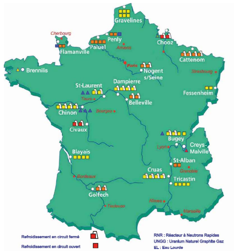
Figure 2: Map of French nuclear power plants

EDF SA owns and operates in France the largest nuclear fleet in the world, built by the Group as architect-engineer. The nuclear fleet includes 58 reactors with three different power levels (900MWe, 1300MWe and 1450MWe).