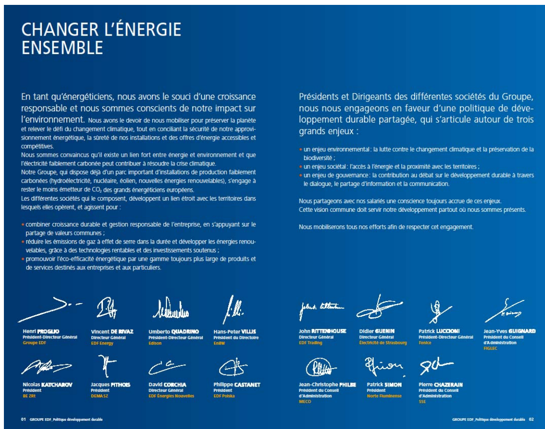
Figure 1: EDF commitment "Leading the Energy Change"