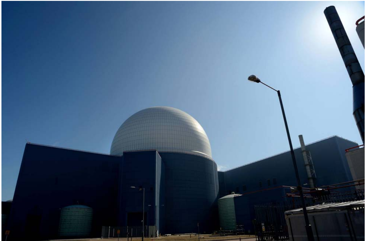
Figure 5: Sizewell Nuclear Power Plant